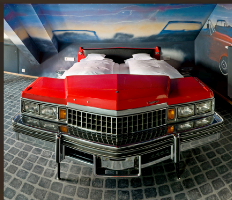
Themed room Drive-In-Cinema