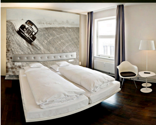
Typical double room