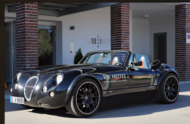
Ask for the Wiesmann car arrangement