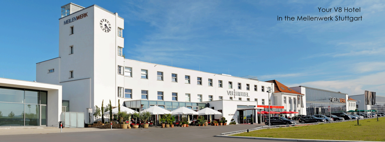
Event-hall "Hall of Legends" for up to 800 people

Your V8 Hotel in the Meilenwerk Stuttgart