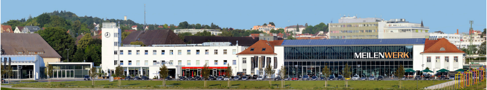
Meilenwerk Stuttgart at the former airfield Böblingen