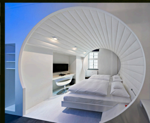
Themed room Vision