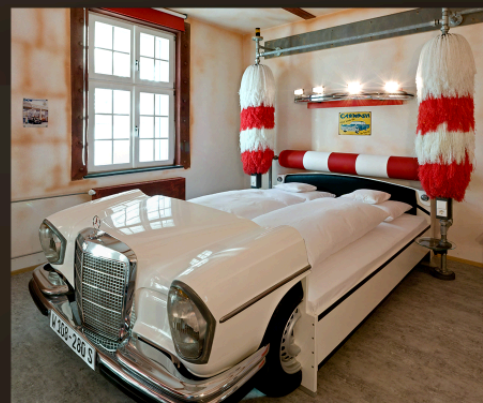
Themed room Car Wash